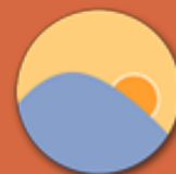
Flux Light Regulation